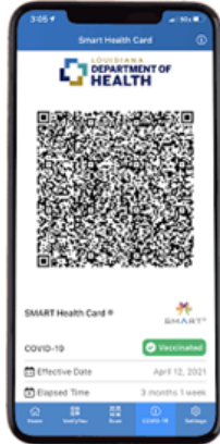
LA Wallet App's Smart Health Card