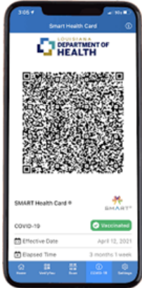
LA Wallet App's Smart Health Card